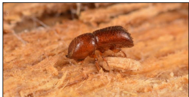
Male Beetle

Meanwhile in California, reports of dying valley oak ( Quercus lobata ) came from Napa and Sonoma counties in 2019. Large populations of MOB have