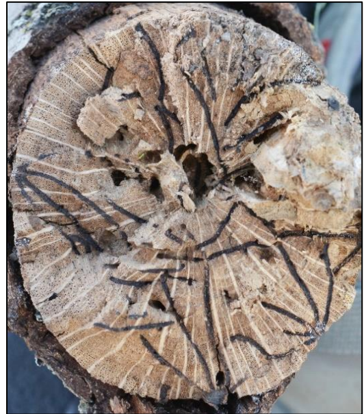
Galleries of native ambrosia beetles (Monarthrum sp.) in oak. Note that the galleries do not branch and have minimal crossing. Additionally, Monarthrum ambrosia beetles do not attack healthy, live trees.