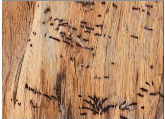
Galleries in valley oak infested with MOB.

local beetle populations increase. Broken branches and dead canopies occur in advanced stages.