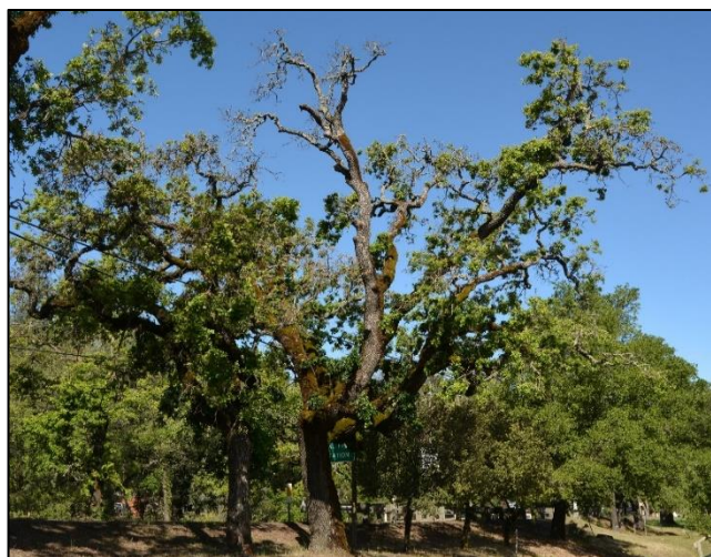
Later stages of MOB infestation when beetles have progressed down tree branches towards main bole of oak tree.

Initial probing galleries are simple and up to 1 m long. Later the tunnels, or galleries, are branching, trellis-like and black stained. The tunnels are crowded, 1.2-1.5 mm in diameter, fan out in a plane, cross, fork, and may intersect. There are no egg niches or specialized larval tunnels.