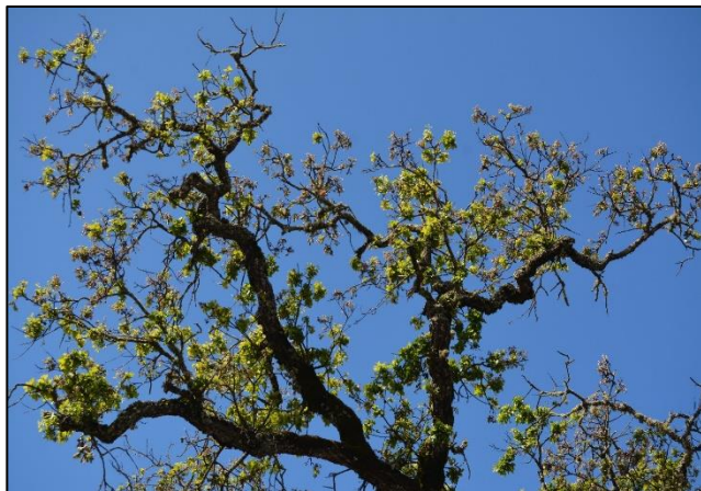
Wilting and canopy dieback of oak infested with MOB.

The bark has abundant round entrance and exit holes about 1/16" (1.3-1.5 mm) in diameter.