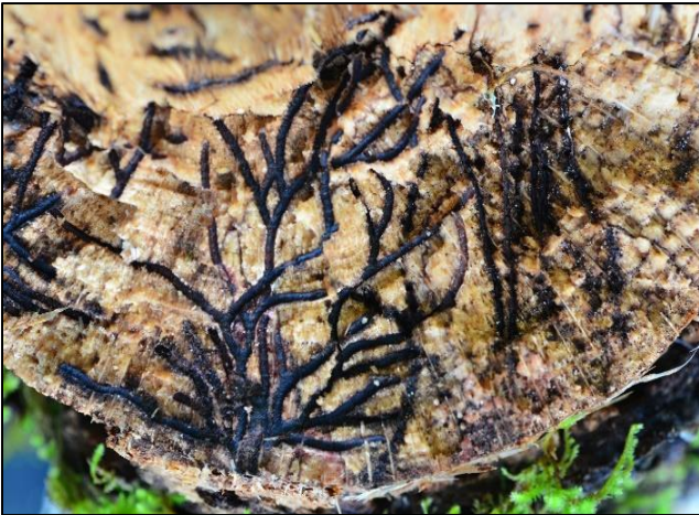
Galleries in valley oak infested with MOB.