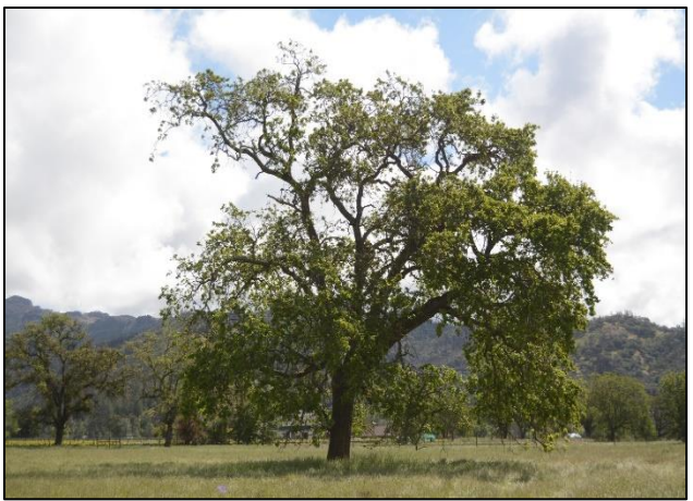
Canopy dieback of oak during early stages of infestation by MOB.

local beetle populations increase. Broken branches and dead canopies occur in advanced stages.