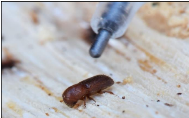
Female Beetle – Source: Curtis Ewing, CAL Fire

The Mediterranean oak borer (MOB) is a pencil-lead-sized brown “ambrosia” beetle. Female beetles tunnel into thin-barked sites or bark cracks on the upper branches, broken branches or freshly cut firewood of oak trees, and probably other hardwoods. They carry fungi within specialized pits near their mouth parts, inoculate their tunnels or “galleries” with fungi such as Raffaelea montetyii